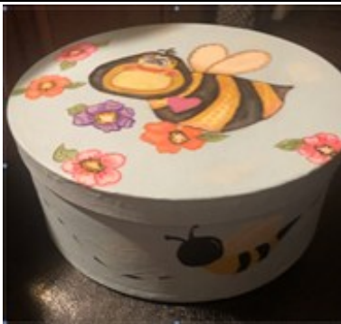
“What’s the Buzz”