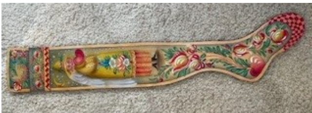
“Stretchy Christmas Stocking”