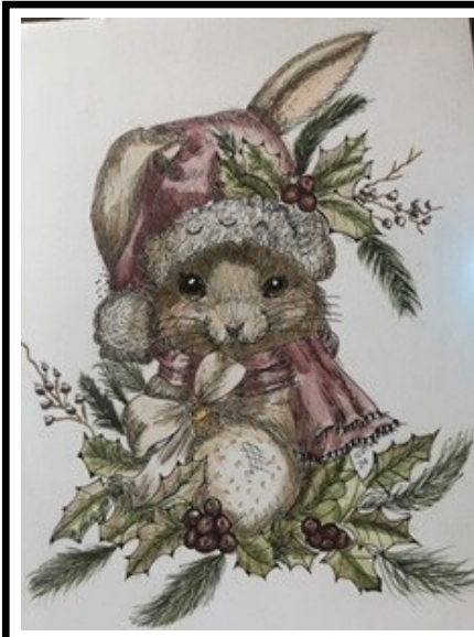
"Holly Christmas Bunny"